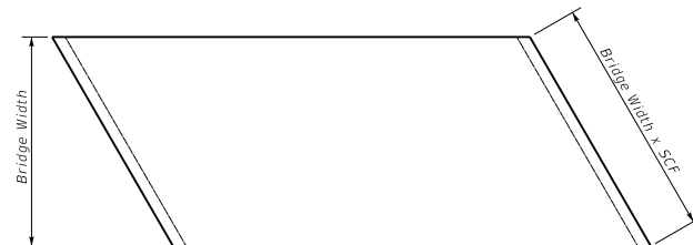
PLAN OF SUPERSTRUCTURE SLAB

MATERIAL SPECIFICATIONS: Concrete, Class "A" = 3500 psi Steel Reinforcement = Grade 60